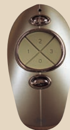
24750 New Style Speedboat. Remote Control