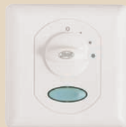
24757 Wall Control.

Your Hunter Fan also comes with several options for operation, including a wall mounted switch.