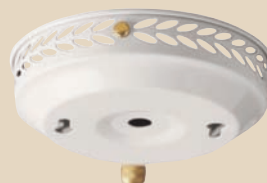
24432 Globe Adapter (needed for globe attachment).